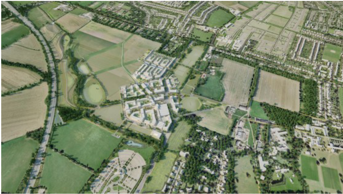
A block perspective model of the proposed Phase 1. The M11 runs in a curve south to north on the left-hand side, Huntingdon Road runs diagonally south-east to north-west towards the top of the model, with the Madingley Road park-and-ride facility in the south-west quadrant at the bottom. Further images can be found at http://www.nwc.cambridge.co.uk .

11. The development is intended to be one of which the University can be proud, and that will stand the test of time. The North West Cambridge development will represent the next generation of urban, sustainable living. It will be the first major development in the UK built to Level 5 of the Government's Code for Sustainable Homes. Level 5 of the Code is effectively zero-carbon in sustainability standards and will mean that the dwellings will have some of the lowest energy and water use in the country. Non-residential and community buildings will be built to BREEAM Excellent standards. There will also be a district heating scheme and dedicated cycle links to the centre of the City and the West Cambridge site.